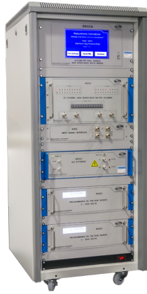
6600A-10 kV System shown with optional 10 kV extender and 10-channel scanner

Developed & designed by metrologists for metrologists & calibration technicians